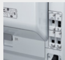
Ethernet/Fax port options (WF-C879R only)