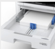
500-sheet paper cassette