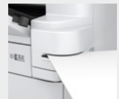
Stapler (WF-C879R only)